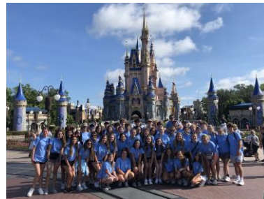
2021 Disney Summer Trip photo